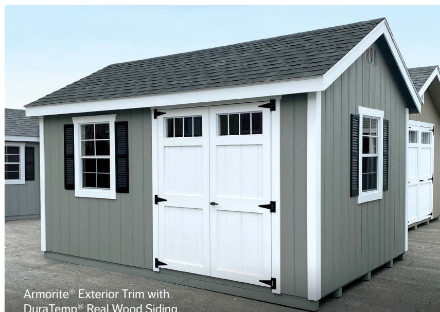
Armorite® Exterior Trim with DuraTemp® Real Wood Siding

With a U.S.-based supply chain, Armorite® Exterior Trim is ready for your next project.